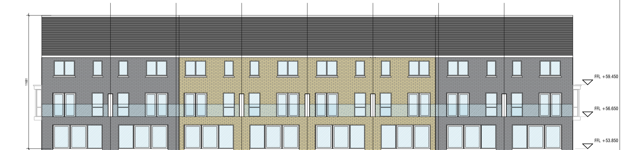
REAR ELEVATION SCALE 1:200