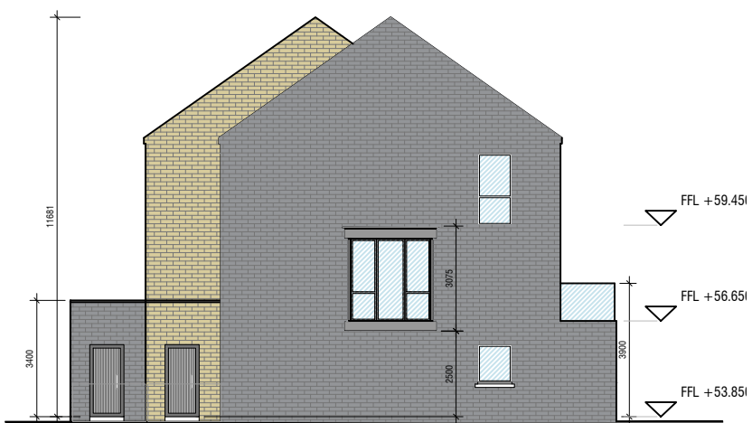
RHS ELEVATION SCALE 1:200