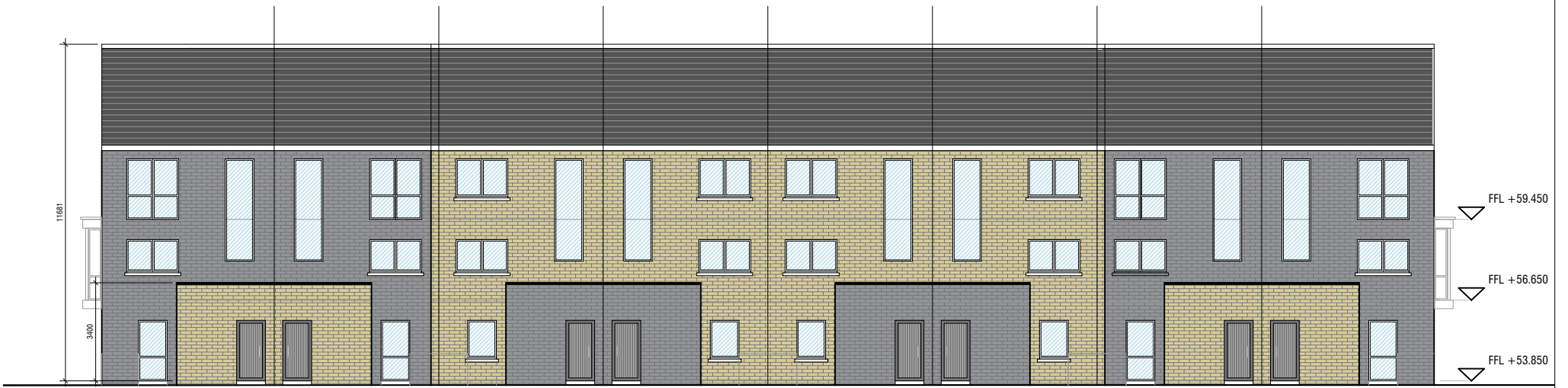
FRONT ELEVATION SCALE 1:200