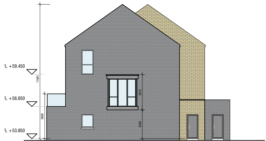
LHS ELEVATION SCALE 1:200