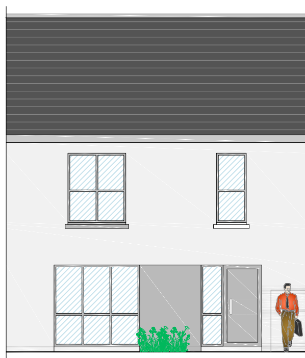
FRONT ELEVATION D1