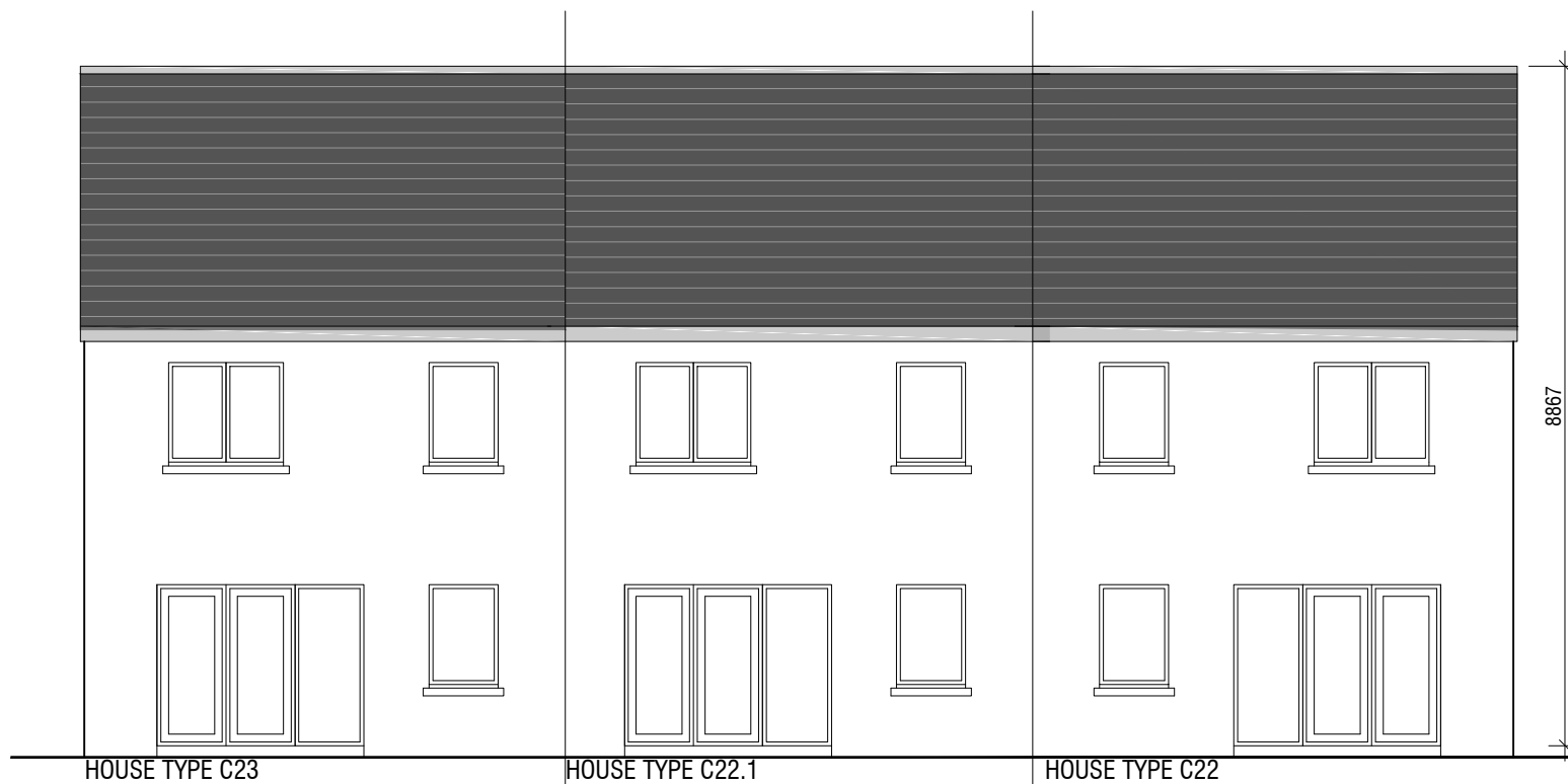
REAR ELEVATION C22 C22.1 & C23 SCALE 1:100