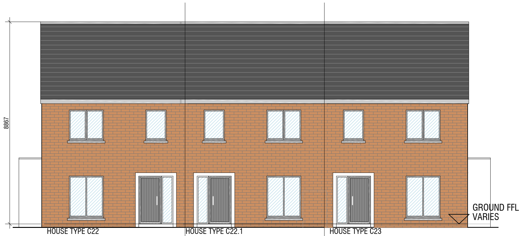
FRONT ELEVATION C22 C22.1 & C23 SCALE 1:100