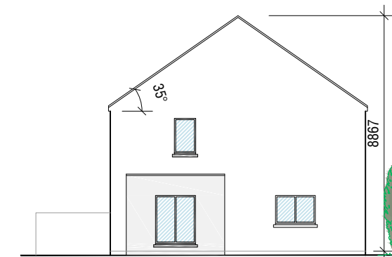
SIDE ELEVATION C23 SCALE 1:200