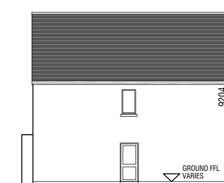
SIDE ELEVATION C9.1