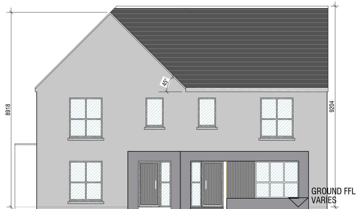
FRONT ELEVATION C9.1 & C12