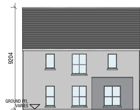
SIDE ELEVATION C12