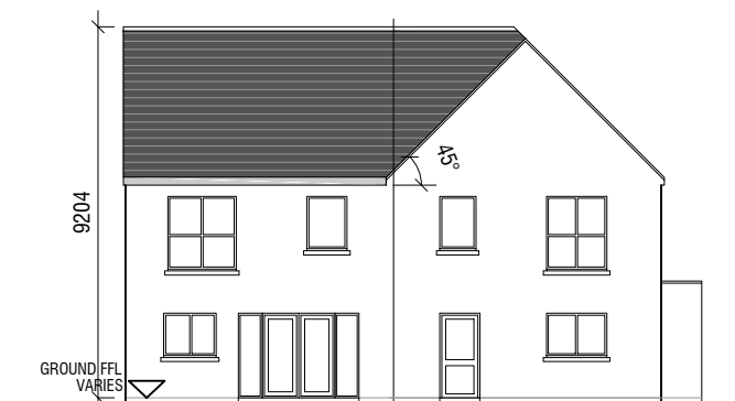
REAR ELEVATION C9.1 & C12